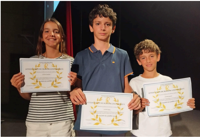
At the end of the course, the students receive a pedagogical report and a certificate of training.